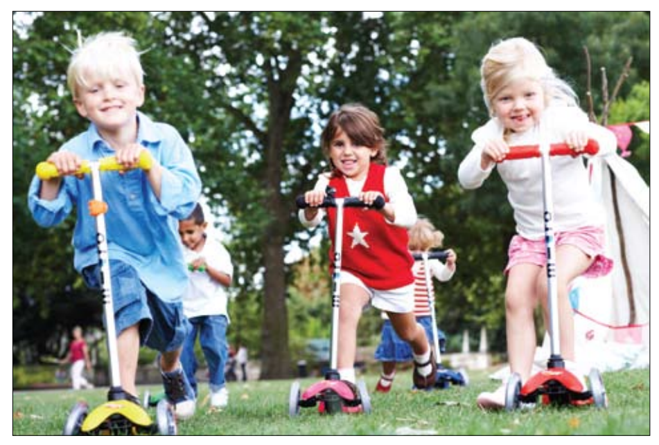
Children enjoying their micro-scooters. MICRO-SCOOTERS