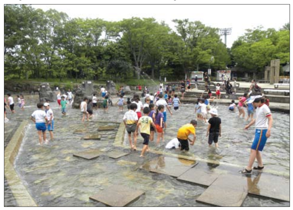
Jingumae students playing in the water park at Kyodo no Mori Museum.

Jingumae International Exchange School (JIES) students went on a school excursion, along with students from Jingumae Elementary, on June 6. This annual event is just one of the "whole school" activities that both the Exchange School and the Japanese school go on as part of their exchange program.