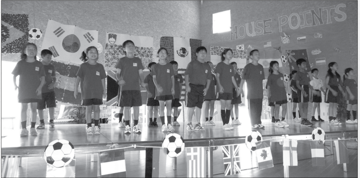
Makuhari International School students performing for 250 parents and friends during their International Day last month.

On July 14, Makuhari International School celebrated its second International Day, with over 250 parents and "Friends of the School" attending. It was a very special day where the children commemorated the internationalization the school works hard to achieve.