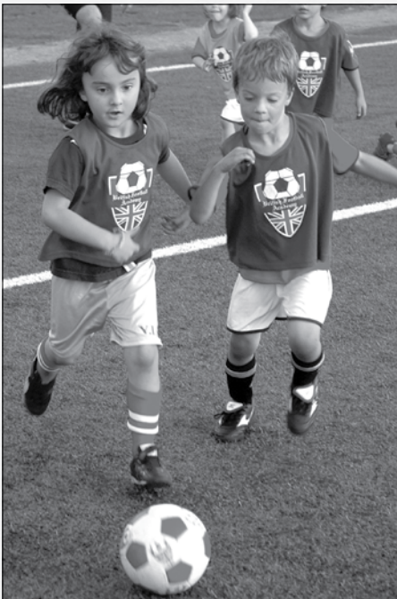
British Football Academy "Bulldogs" enjoying a class at Yokohama Country and Athletic Club.

The British Football Academy (BFA) is holding its Summer Soccer Camp at the Yokohama Country & Athletic Club on August 16–18. "Football Fun in the Sun" is open to all children aged 3–15 years, and English Football Association qualified coaches will be on hand to teach and entertain these energetic youngsters.