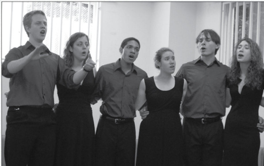
Yale's visiting choir singing at New International School. NEW INTERNATIONAL SCHOOL

Old news, but not forgotten; last May, New International School hosted the Yale University Cappella Choir, and arranged home stays for all 17 of them for ten days. The group performed for the whole school, had sessions with different age ranges of children, and finally sang with all of the children from the ages of 4 to 15 years, to the delight of all.