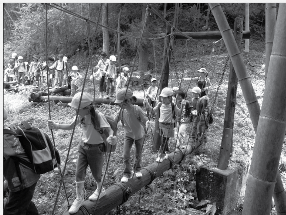
Katoh Gakuen students balancing their way through the Shimizu forests during their school camping trip in July.