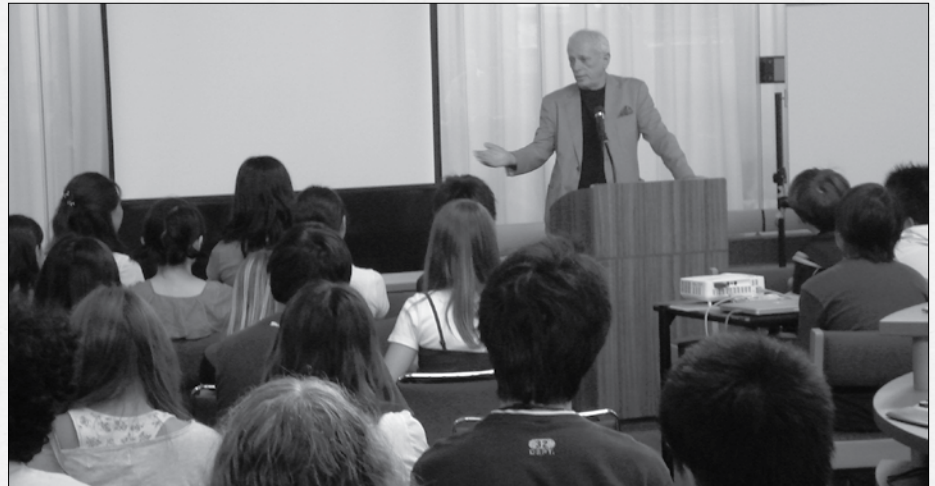
Activist Richard O'Barry speaking to Nagoya International School students.

Dolphin-trainer-turned-activist Richard O'Barry visited Nagoya International School on June 14 and spoke with middle and high school students about dolphins, the cruelty of capturing dolphins for the sea-park industry, and his role in the academy-award winning documentary, The Cove .