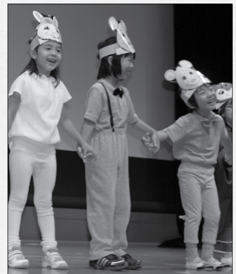
Students at American International School Joy to the World enjoying a round of applause at their end-of-term performance.

Activities such as these are helpful opportunities for the children to experience English. During rehearsals children were asked to discuss the meanings of words in the play's dialogue, and to think about different ways to show those meanings through physical expression. This often led to some very funny situations during rehearsals as well as on stage!