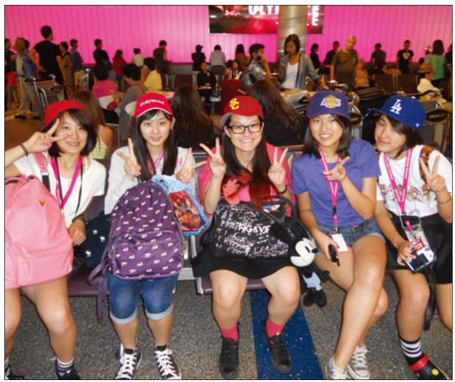
Teenagers enjoying this summer's Education First trip to California.

Last month, 20 Education First (EF) students spent two weeks in Santa Barbara, California. It was the second time for some to enjoy this trip, so they got to stay with familiar host families as well as brush up on their English skills. The tour included trips to Disneyland and Universal Studios.