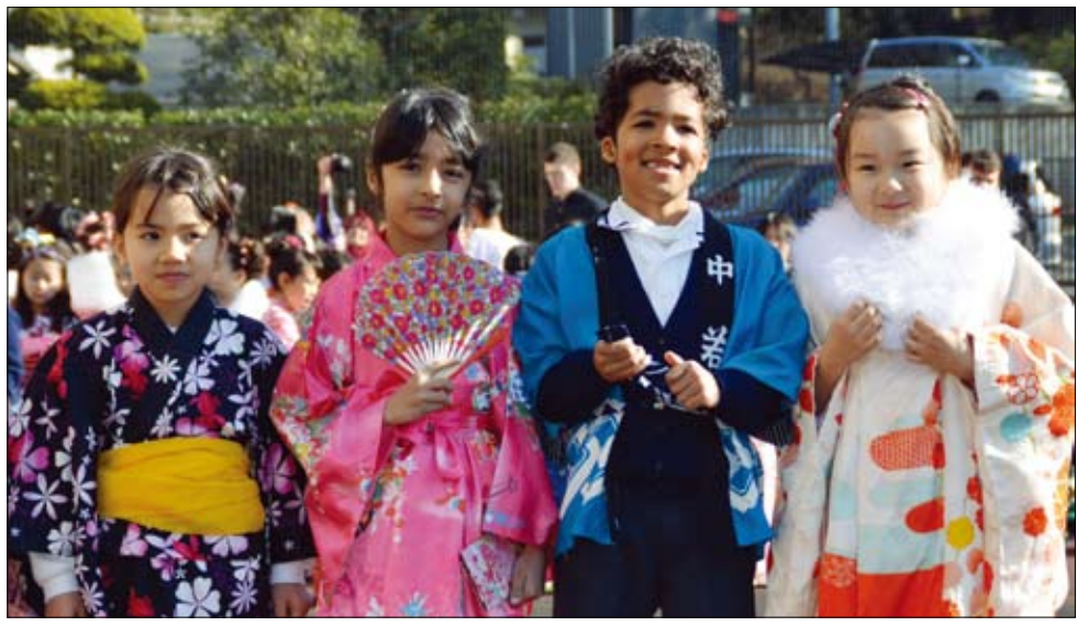
Primary students dressed up for January's Japanese Culture Day at Horizon Japan International School.

Japanese Culture Day at Horizon Japan International School was a huge success this year, with students having fun and learning all about Japanese culture.