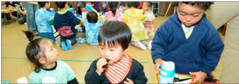
Kailua children enjoy yummy mochi at their annual mochitsuki.