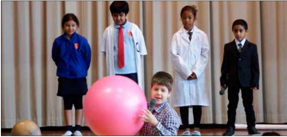
Celebration of learning JINGU-MAE INTERNATIONAL EXCHANGE SCHOOL