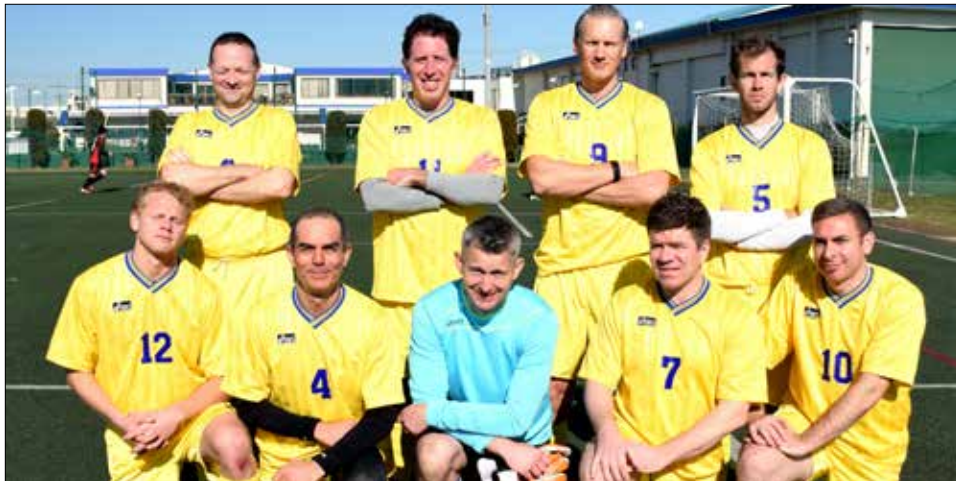
Kanto Academica FC FOOTY JAPAN