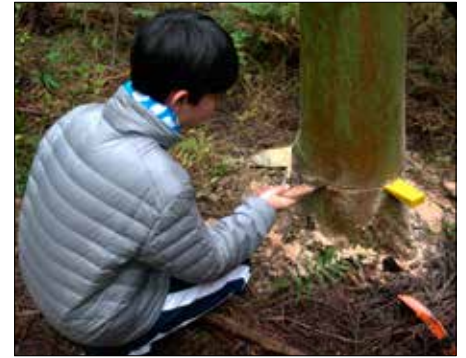
A student helping to thin the forest by cutting down a tree. K. INTERNATIONAL SCHOOL

After the Celebration of Learning, the PTA put together refreshments. The whole performance was a huge success with many visitors from the school and local community. It was clear to see that the students were proud of themselves as they were able to give their best performance so far for this Winter Performance. Thank you to all of the students, parents, and school community for coming. Our next Celebration of Learning will be coming up early next year. We hope you will be able to attend and look forward to seeing you there.